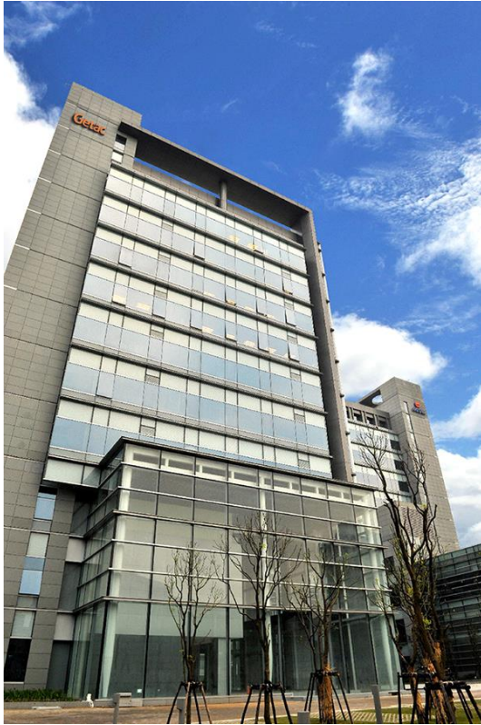
Getac Global Headquarters, Taipei Taiwan